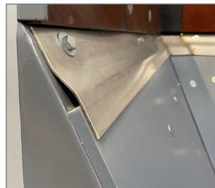
Stainless steel edge capping available