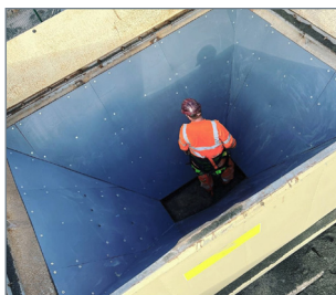
Ideal for bins, chutes & hoppers

We believe that Matrox is the best UHMWPE lining material on the market, but we also stock a range of more economical PE1000 liners for less demanding applications. With both products however, it is critical to install them correctly. We have produced a manufacturer-approved installation guideline document which we recommend that you follow.