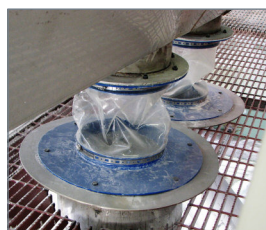
Large stockholding of seamless tubing