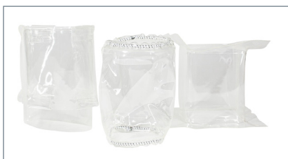
Custom round, square & rectangular connectors

* The manufacturer states that ClearFlex SDX is the only polyurethane film product on the market that offers superior clarity, FDA food contact compliance, EU food safety compliance and exceeds the compliance standards for the EU ATEX (Explosive Atmospheres) regulation for Zones 20, 21, 22. Certificate of compliance available on request.