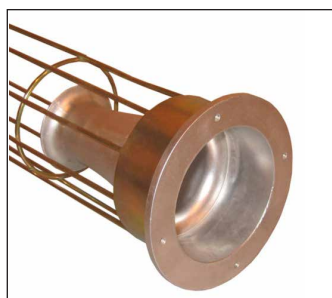
Dirty side or clean side removal. With or without venturi