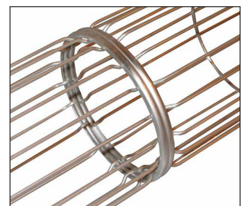
Hook and claw or patented double ring connections