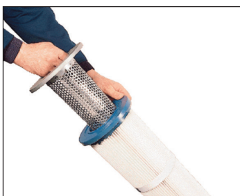
Reusable inner mesh core

CSV 21 and 24.5 filters are smaller in diameter than other models which is made possible due to the use of conical cartridge technology. It is not recommended to install parallel cartridges as spacing will become restricted leading to a loss of efficiency through increased cross contamination and re-entrainment. Certification may also be compromised.