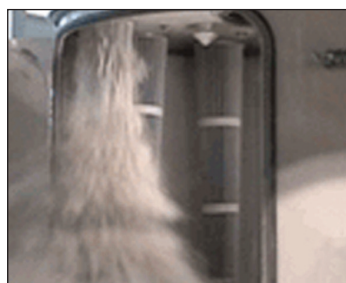
High efficiency cleaning