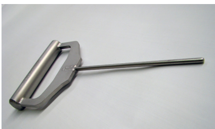
The BFM® 'TR Release Tool'.

The BFM® TR (tool release) O40E and O40AS fittings have an embossed identifier stamp to make them easy to differentiate from our standard fittings.